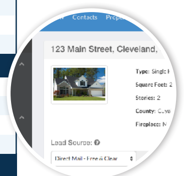
PUBLIC INFO SEARCH

All plans include Email, Phone, and Live Chat support, as well as comprehensive training.